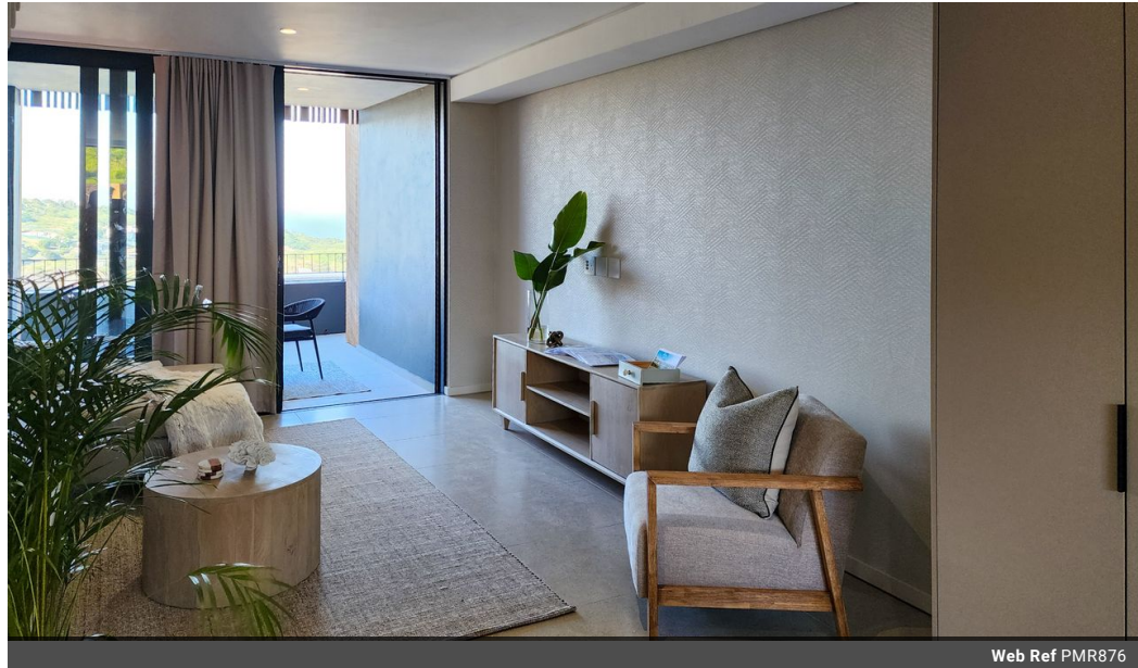
Web Ref PMR876

Douglas Crowe Drive, Ballito, 4420 - 14 Silverstone Way