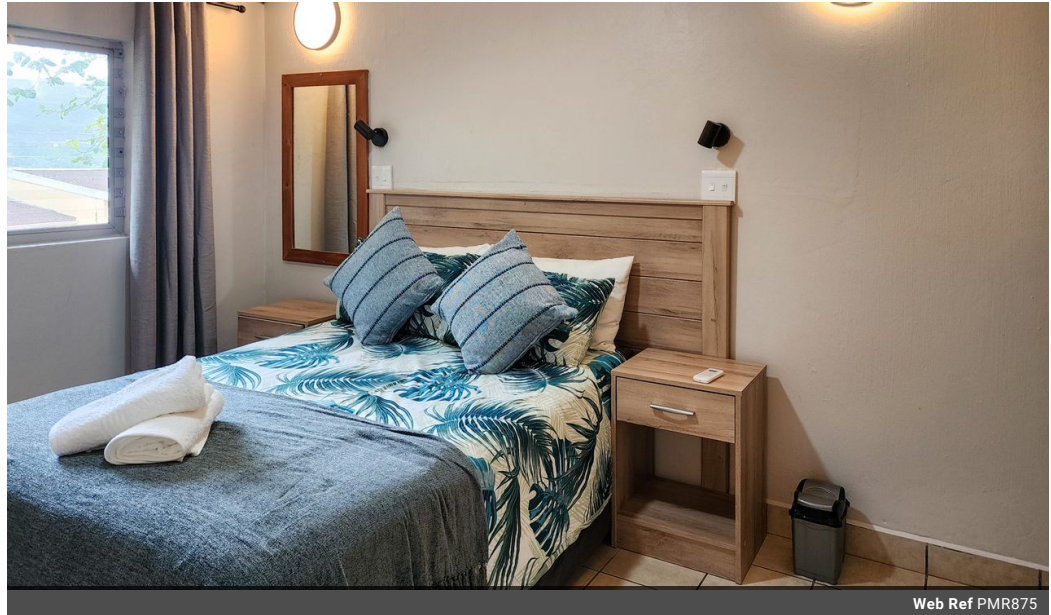
Web Ref PMR875

Douglas Crowe Drive, Ballito, 4420 - 14 Silverstone Way