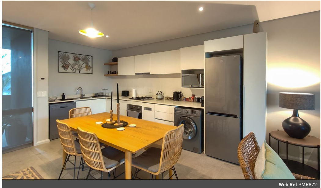
Web Ref PMR872

Douglas Crowe Drive, Ballito, 4420 - 14 Silverstone Way