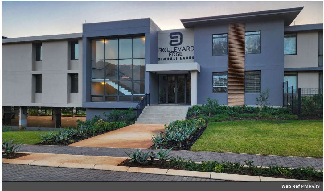
Web Ref PMR939

Douglas Crowe Drive, Ballito, 4420 - 14 Silverstone Way