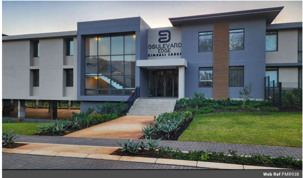
Web Ref PMR938

Douglas Crowe Drive, Ballito, 4420 - 14 Silverstone Way