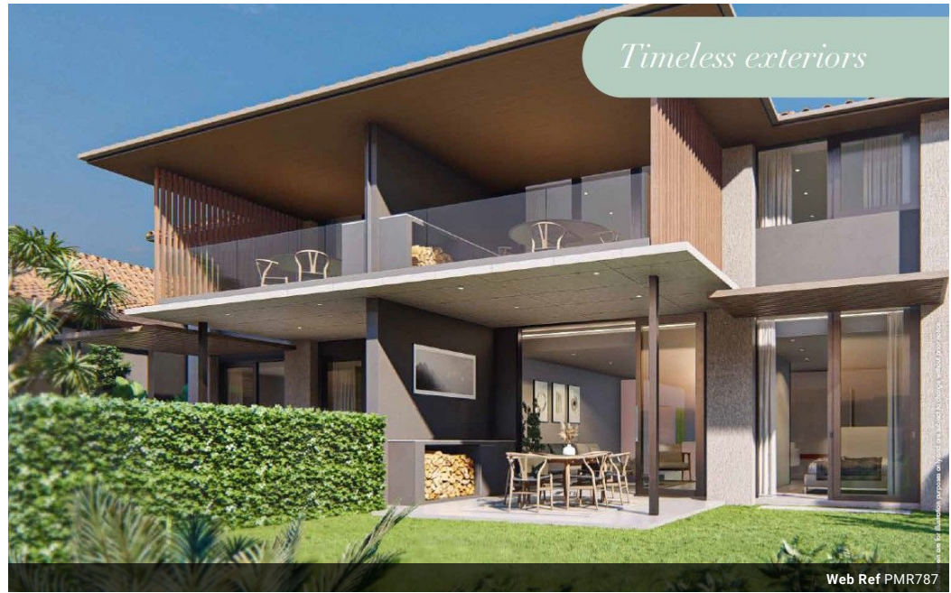
Web Ref PMR787

Douglas Crowe Drive, Ballito, 4420 - 14 Silverstone Way