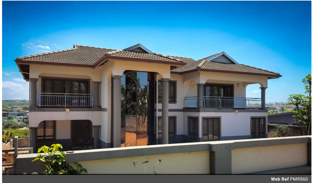
Web Ref PMR860

Douglas Crowe Drive, Ballito, 4420 - 14 Silverstone Way