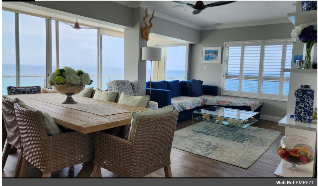
Web Ref PMR571