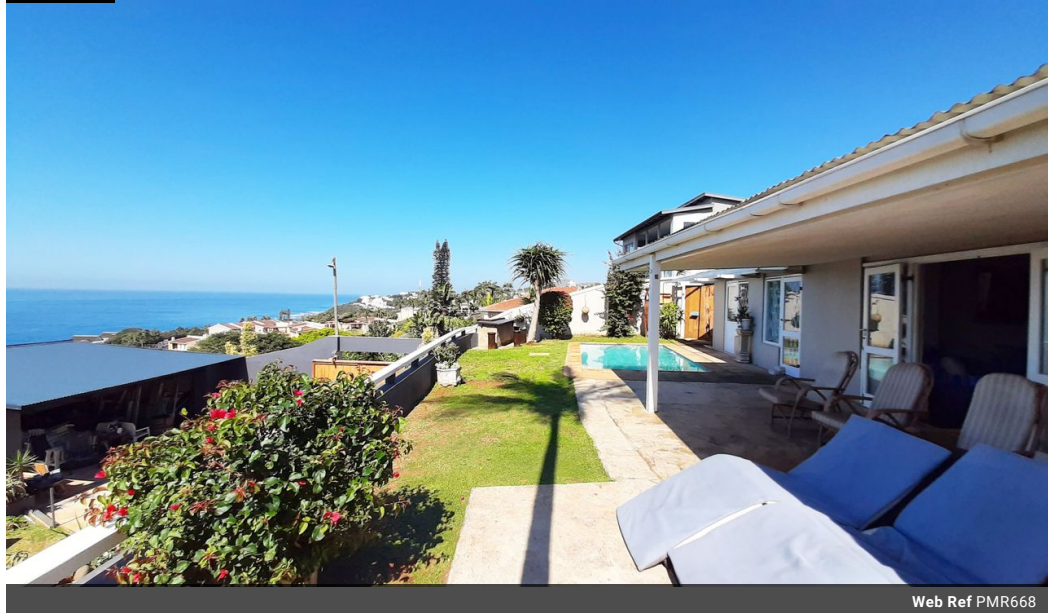
Web Ref PMR668