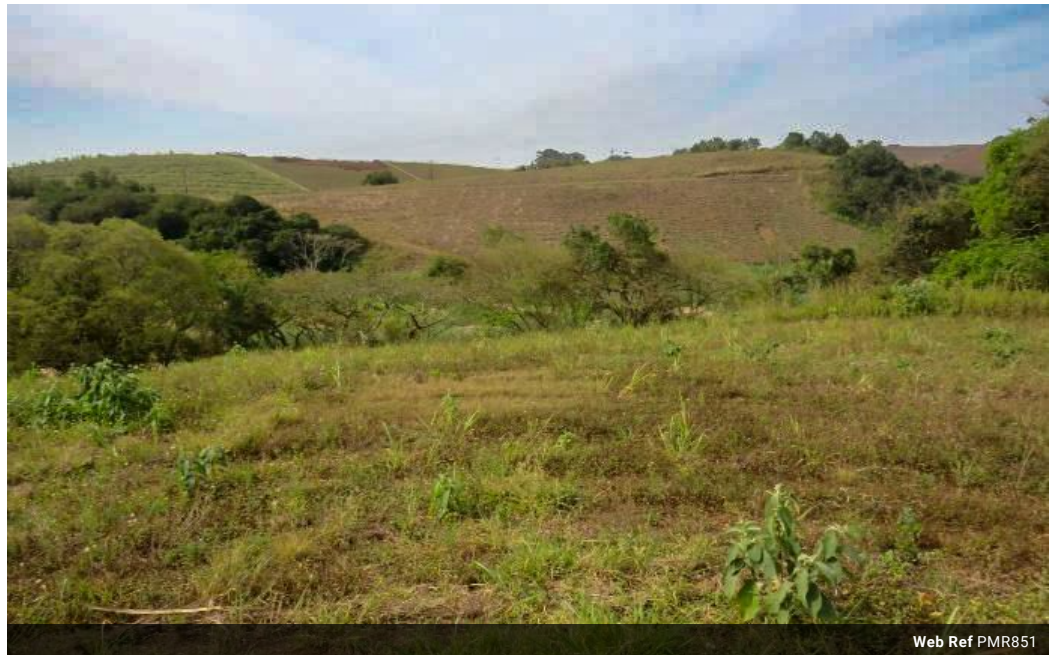
Web Ref PMR851

Douglas Crowe Drive, Ballito, 4420 - 14 Silverstone Way