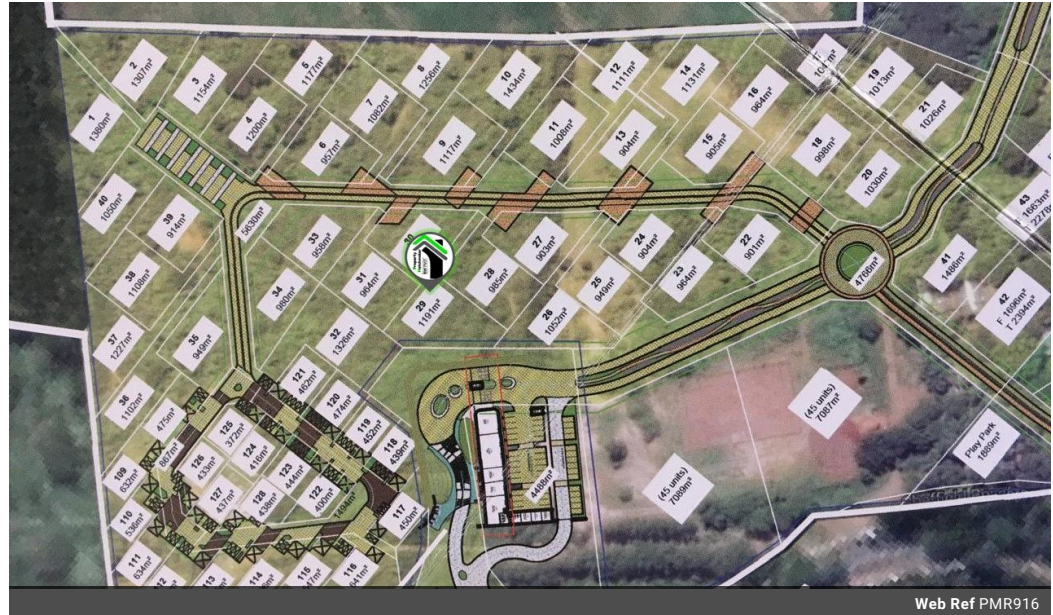
Web Ref PMR916

Douglas Crowe Drive, Ballito, 4420 - 14 Silverstone Way