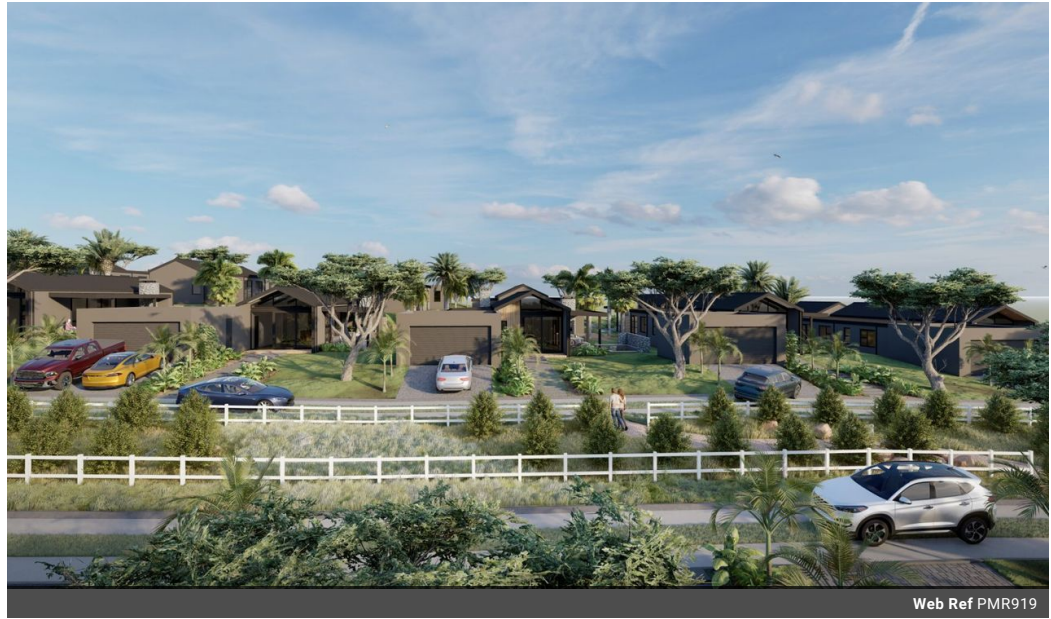
Web Ref PMR919

Douglas Crowe Drive, Ballito, 4420 - 14 Silverstone Way