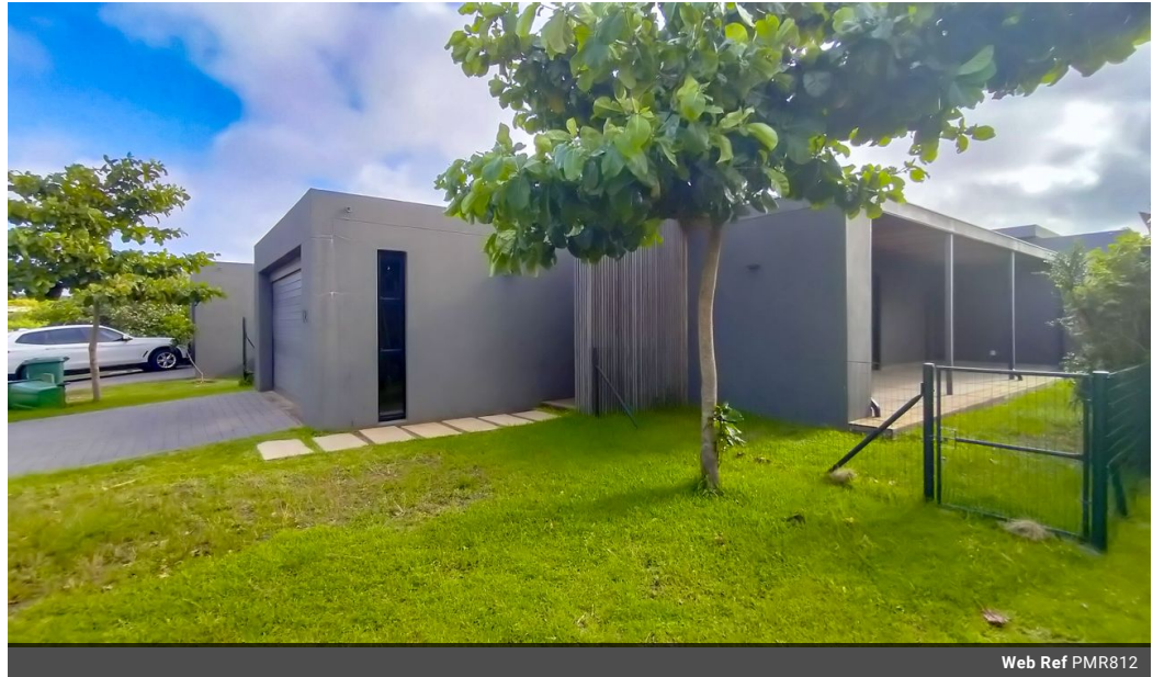
Web Ref PMR812

Douglas Crowe Drive, Ballito, 4420 - 14 Silverstone Way