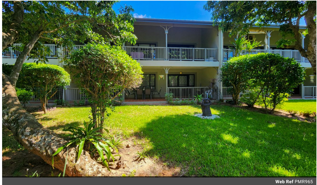
Web Ref PMR965

Douglas Crowe Drive, Ballito, 4420 - 14 Silverstone Way