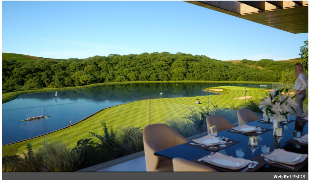
Web Ref PMD8

Douglas Crowe Drive, Ballito, 4420 - 14 Silverstone Way