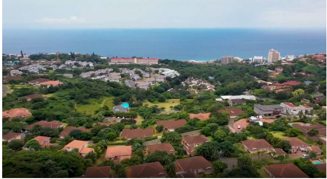
Web Ref PME11

Douglas Crowe Drive, Ballito, 4420 - 14 Silverstone Way