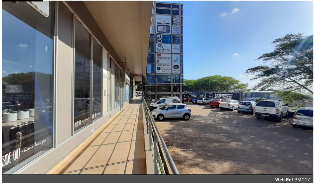
Web Ref PMC17